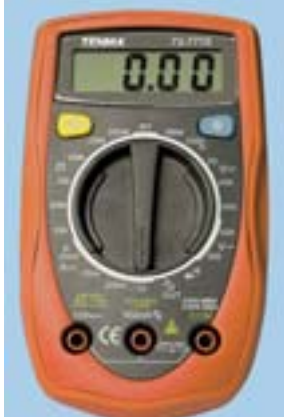
H=137, W=76, D=35mm